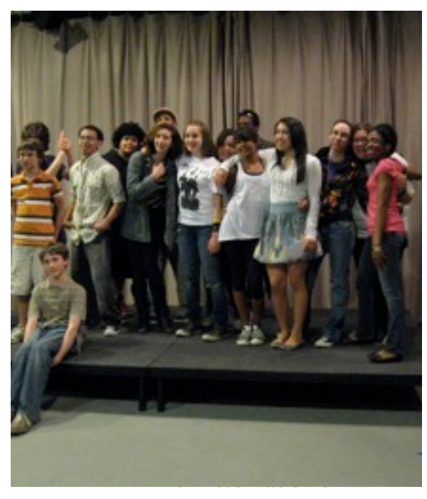
Ensemble members train their Amherst peers in our "Street Beat" theater workshop at the Amherst Media television studio.